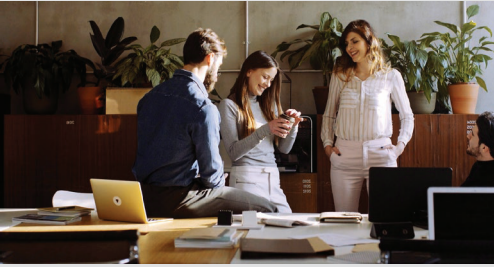
WHAT YOU SEE